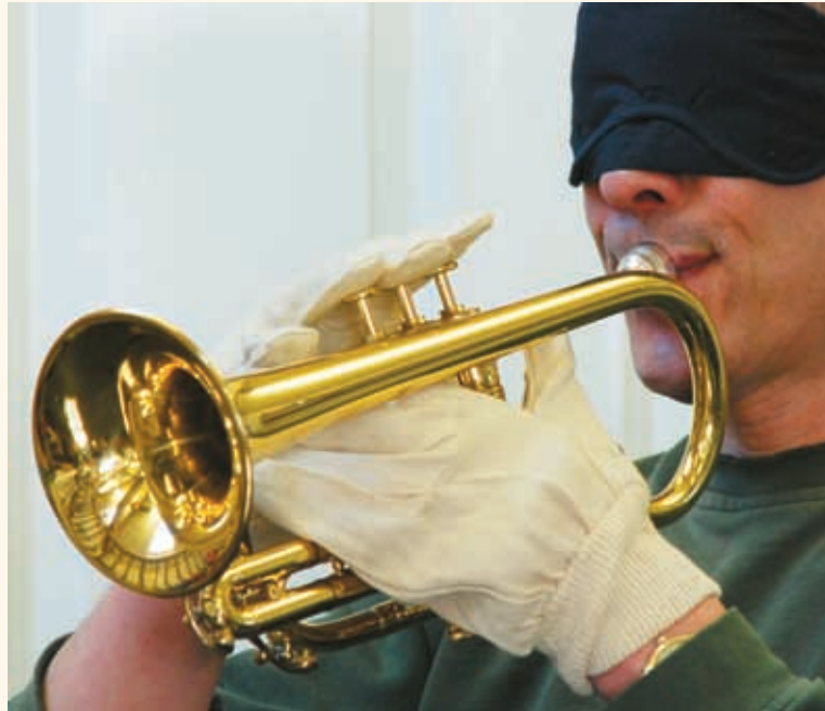
Fig 1. The gloves are on for the first test.

Fellow at Surrey University, I teamed up with an experimental psychologist to develop a technique which would show a player's preferred instrument within a few minutes of testing. At the same time, the Boosey & Hawkes Sovereign cornet, the 921, was not satisfying a few of the leading players in British brass bands and I was asked to design an instrument to counteract this conflict. I chose eight of the best solo cornettists from the leading brass bands to undertake a series of blindfold tests to determine the tone and response characteristics they preferred. I will not reveal their names since the tests not only gave a measure of their preference but also of their skill in distinguishing between instruments!